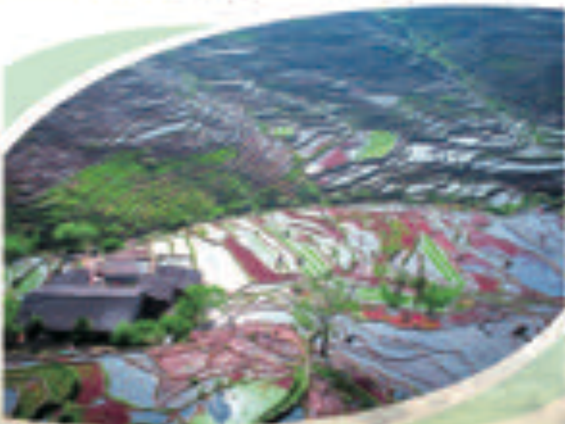
Soil Fertility Maintenance