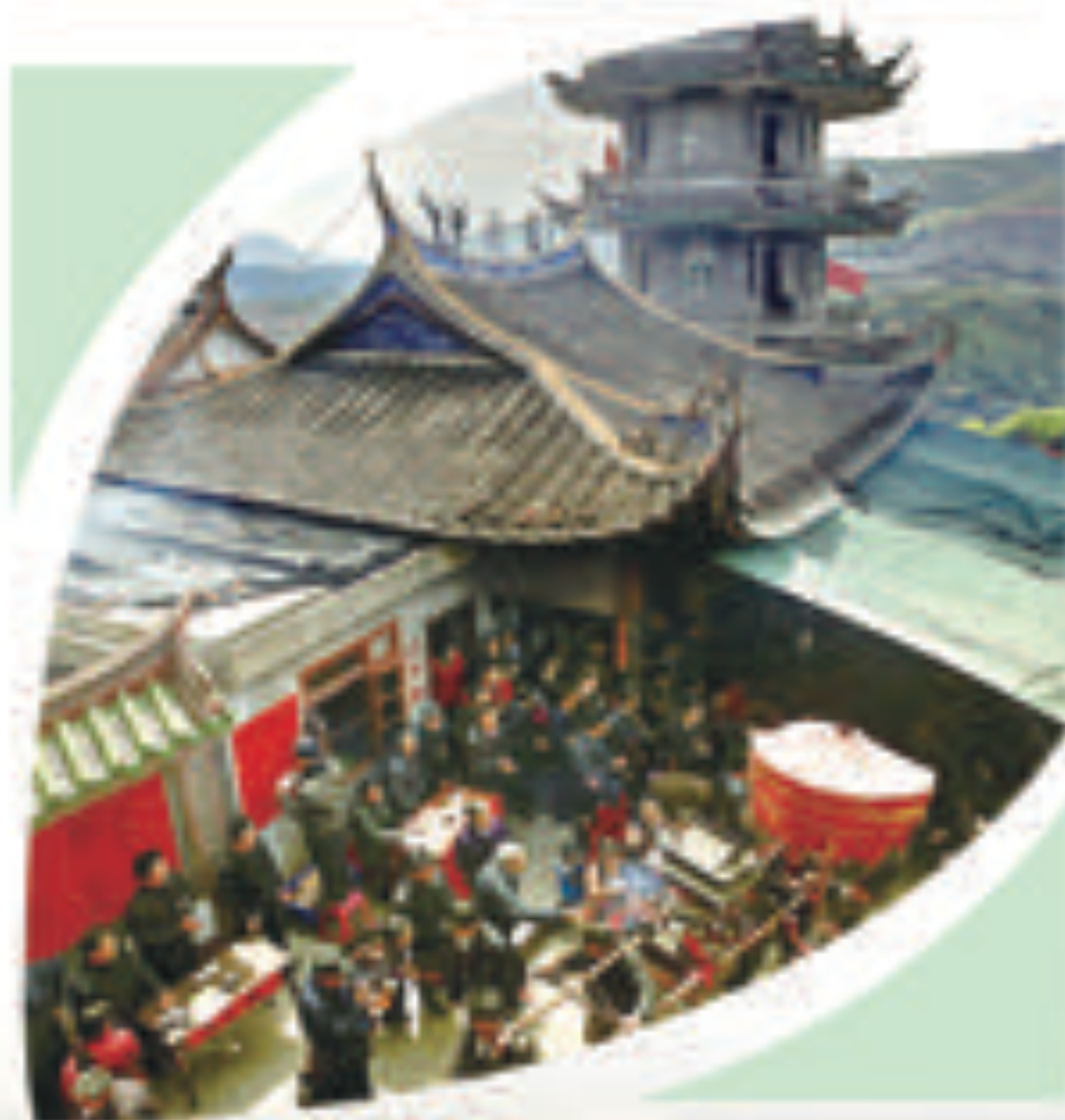
Tiger Subduing Temple Fair

The Tiger Subduing Temple Fair in Lianhe is held on the 27th day of the second lunar month every year. It has a history of over 800 years since the Song Dynasty.