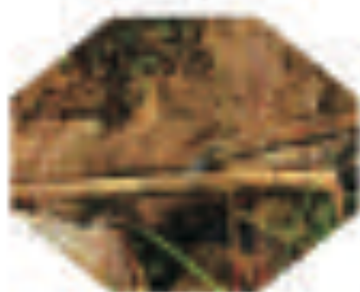
Ditch made of half an emptied bamboo