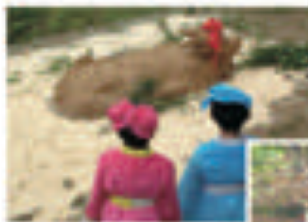
Cattle-Whipping to Welcome Spring