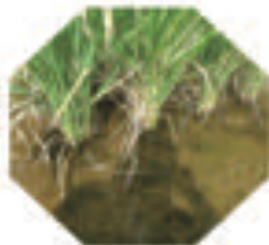
Rice-spiral shell coculture