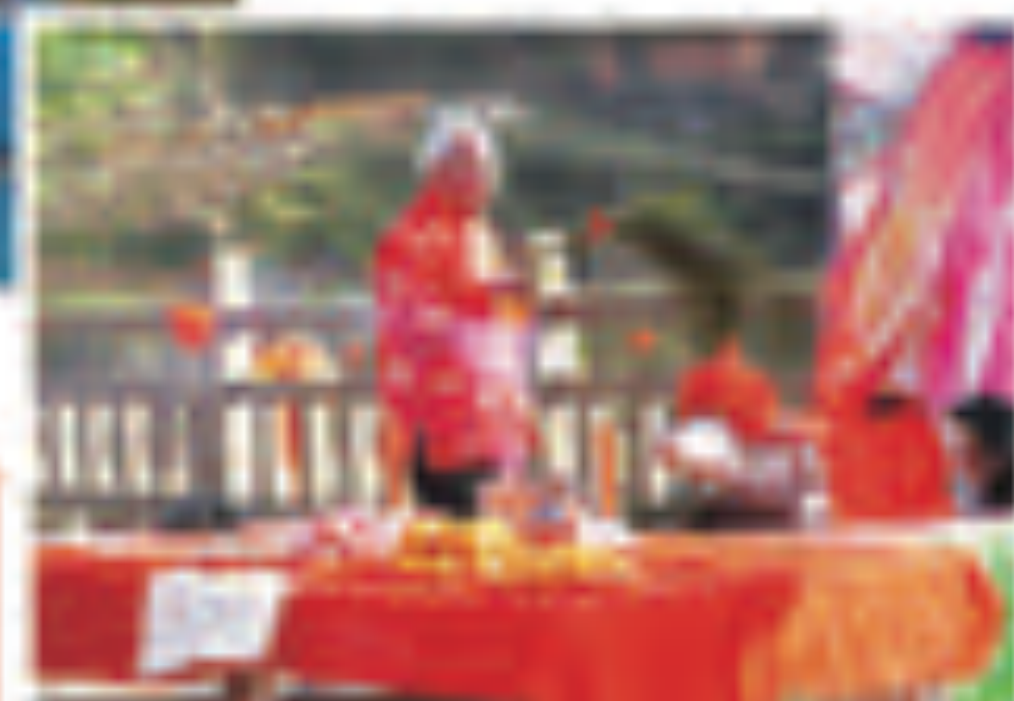
Beginning of winter