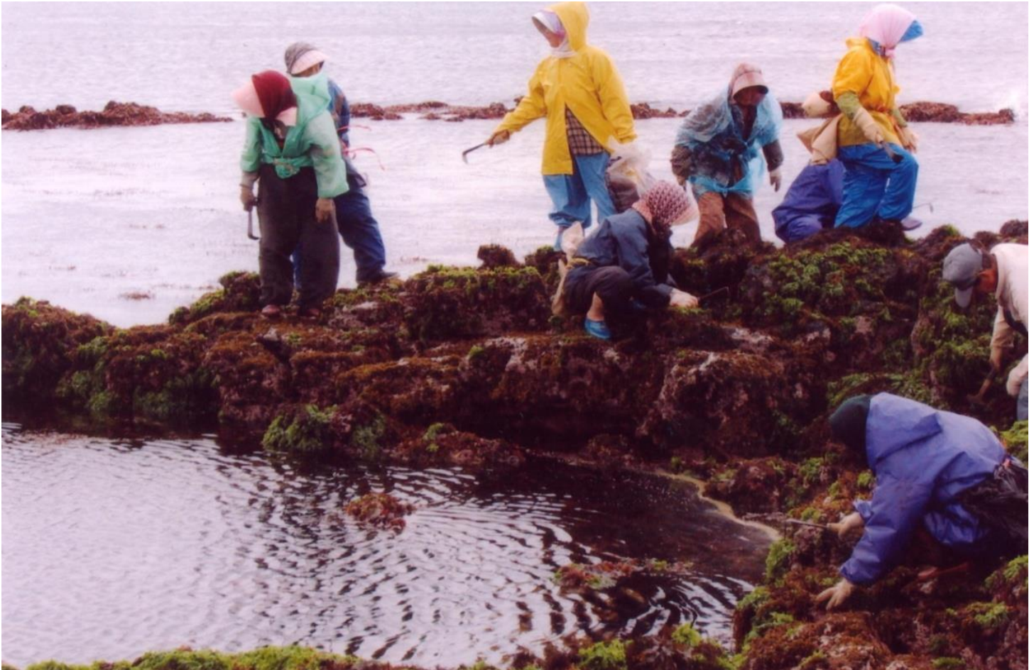
Cleaning the underwater area and intertidal zone