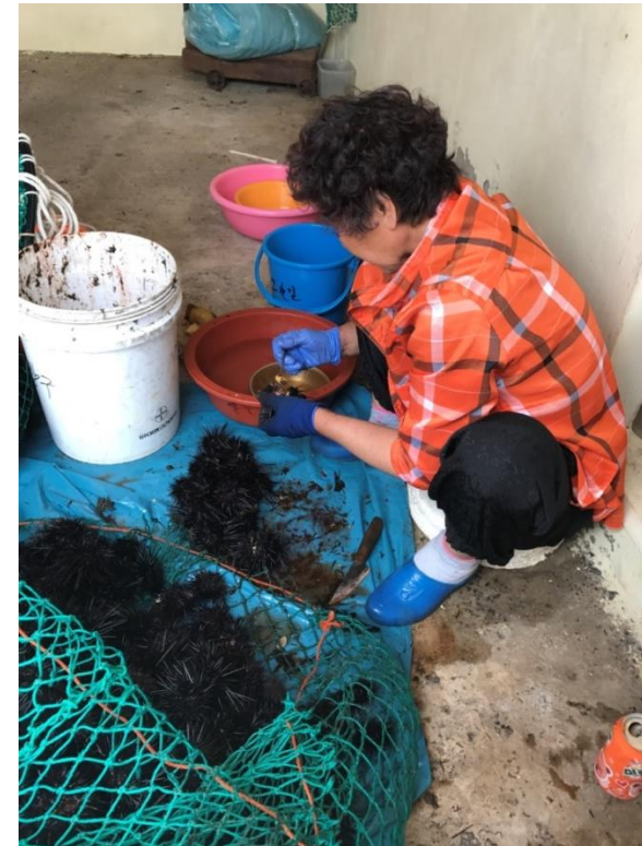
Photographed at Hado-ri 2017. 7. 2