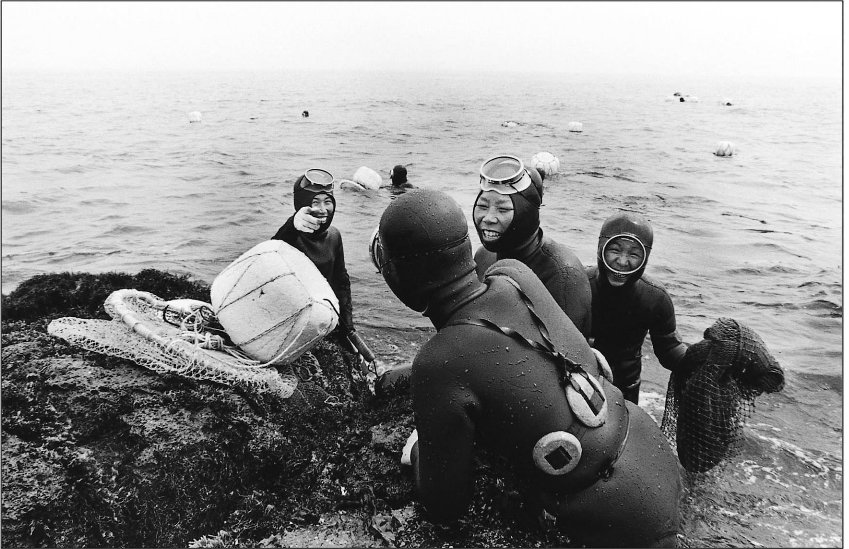
Jeju sanggun [upper-skilled] haenyeo