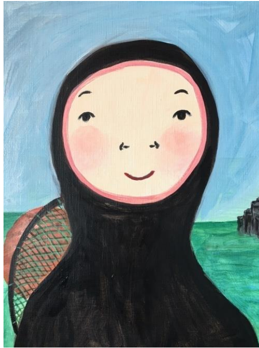
A painting by Eva Armisen