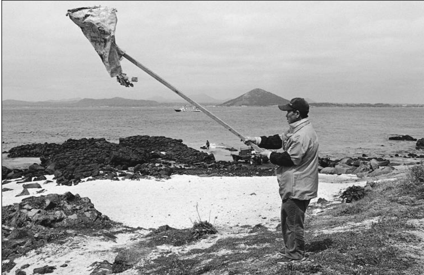
The head of a village fishery cooperative waving a flag in order to stop the diving work