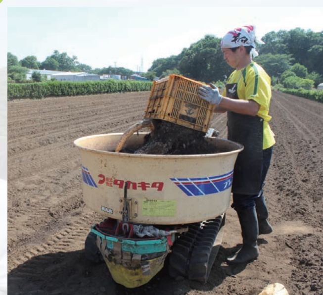
Mixing rich composts

No other fertilizer is better than this says the local farmers