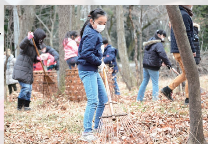
Gathering leaves with citizens