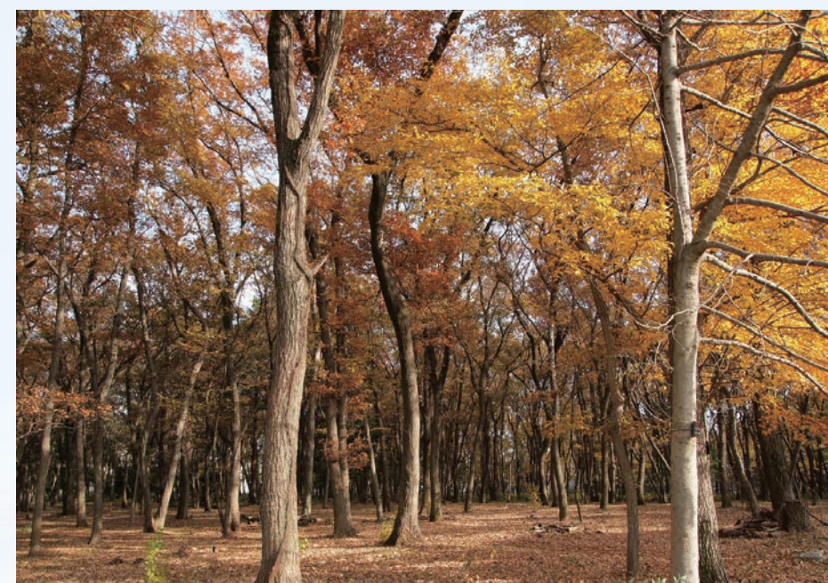
Well maintained agroforestry

No other fertilizer is better than this says the local farmers