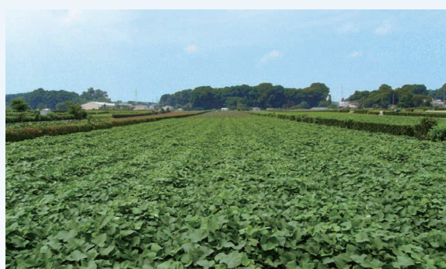
Sweet potato field