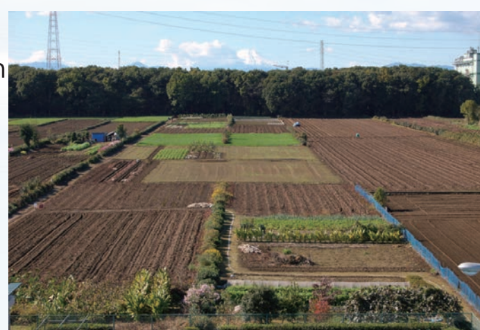
Well maintained fields