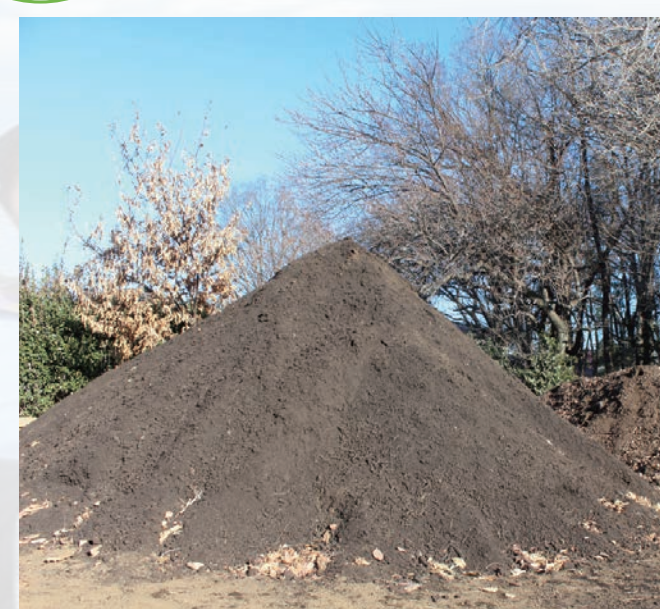
Compost fallen leaves

Raking fallen leaves Cooperation with citizens