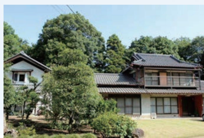
House surrounded by trees

The agroforestry provides good leaves which are composted and then mixed to the soil of fields as fertilizer.